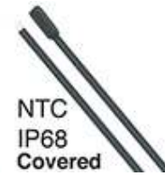
NTC IP68 Covered